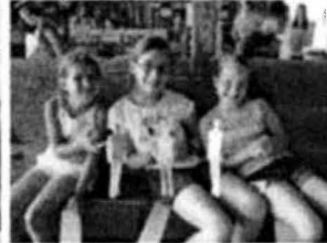
Limberjack toy making