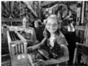
Weaving on looms

Campers will be able to wear colonial costumes, play original colonial games, tour historical sites, handle various historical artifacts that typically are viewed only behind glass displays in museums, and enjoy hands-on colonial-era activities such as: